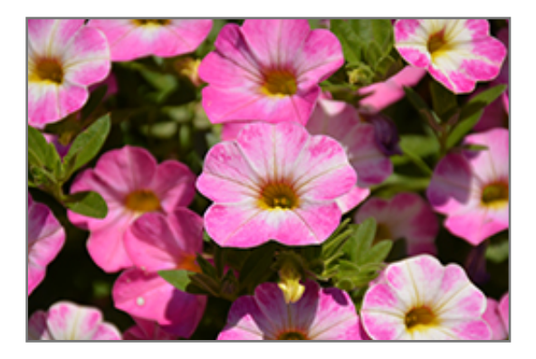
Chameleon Pink Sorbet Calibrachoa flowers