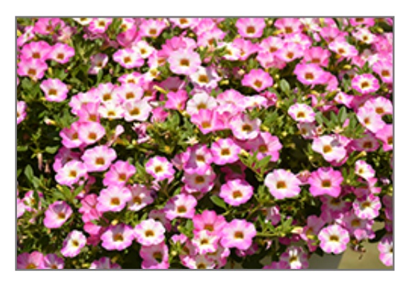
Chameleon Pink Sorbet Calibrachoa flowers

Chameleon Pink Sorbet Calibrachoa is a dense herbaceous annual with a trailing habit of growth, eventually spilling over the edges of hanging baskets and containers. Its medium texture blends into the garden, but can always be balanced by a couple of finer or coarser plants for an effective composition.