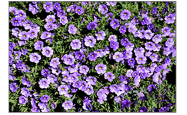
MiniFamous Neo Light Blue Calibrachoa flowers

MiniFamous Neo Light Blue Calibrachoa is a dense herbaceous annual with a trailing habit of growth, eventually spilling over the edges of hanging baskets and containers. Its medium texture blends into the garden, but can always be balanced by a couple of finer or coarser plants for an effective composition.