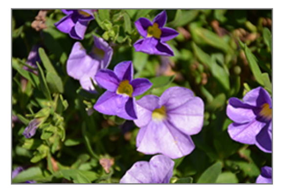
MiniFamous Neo Light Blue Calibrachoa flowers

This plant will require occasional maintenance and upkeep. Trim off the flower heads after they fade and die to encourage more blooms late into the season. It is a good choice for attracting bees and hummingbirds to your yard, but is not particularly attractive to deer who tend to leave it alone in favor of tastier treats. It has no significant negative characteristics.