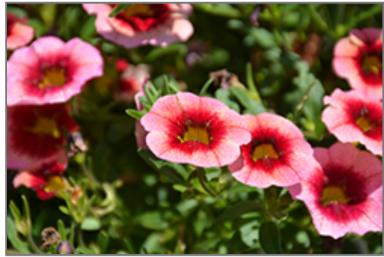
MiniFamous Neo Pink Strike Calibrachoa flowers

MiniFamous Neo Pink Strike Calibrachoa is recommended for the following landscape applications;