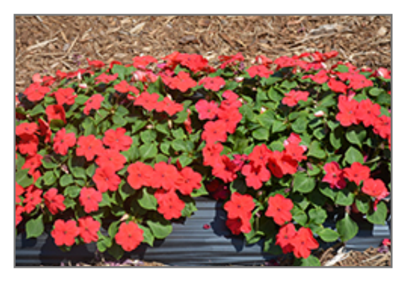
Super Elfin XP Punch Impatiens flowers

This plant will require occasional maintenance and upkeep, and should not require much pruning, except when necessary, such as to remove dieback. It has no significant negative characteristics.