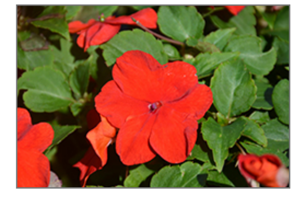
Super Elfin XP Punch Impatiens in bloom

Super Elfin XP Punch Impatiens is a dense herbaceous annual with a mounded form. Its medium texture blends into the garden, but can always be balanced by a couple of finer or coarser plants for an effective composition.