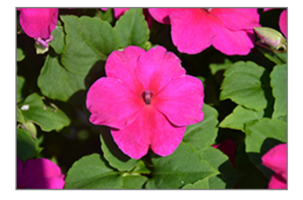
Super Elfin XP Violet Impatiens flowers

Super Elfin XP Violet Impatiens is a dense herbaceous annual with a mounded form. Its medium texture blends into the garden, but can always be balanced by a couple of finer or coarser plants for an effective composition.