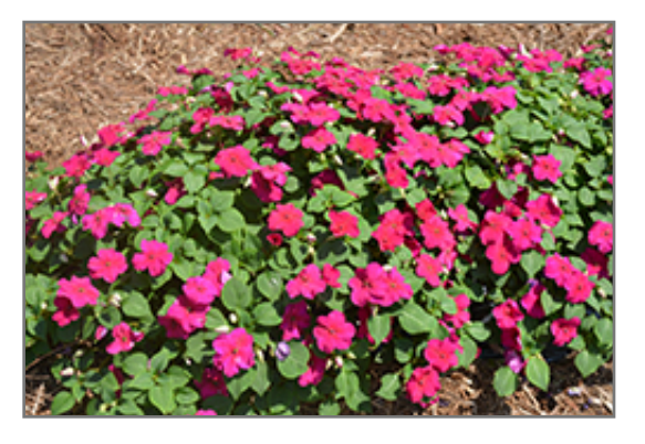
Super Elfin XP Violet Impatiens in bloom

This plant will require occasional maintenance and upkeep, and should not require much pruning, except when necessary, such as to remove dieback. It has no significant negative characteristics.