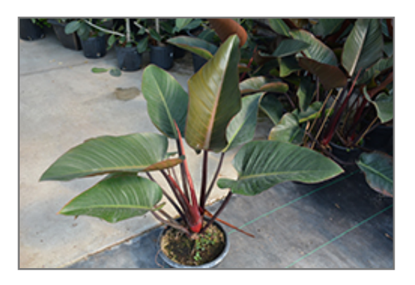
Rojo Congo Philodendron