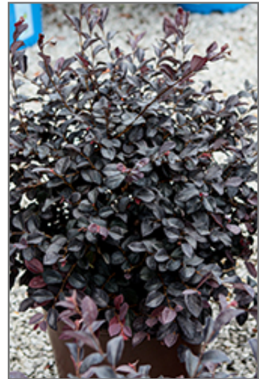
Cherry Blast Fringeflower

Cherry Blast Fringeflower makes a fine choice for the outdoor landscape, but it is also well-suited for use in outdoor pots and containers. Because of its height, it is often used as a 'thriller' in the 'spiller-thriller-filler' container combination; plant it near the center of the pot, surrounded by smaller plants and those that spill over the edges. It is even sizeable enough that it can be grown alone in a suitable container. Note that when grown in a container, it may not perform exactly as indicated on the tag - this is to be expected. Also note that when growing plants in outdoor containers and baskets, they may require more frequent waterings than they would in the yard or garden.