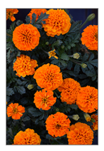
Hot Pak Orange Marigold flowers

Bossier City - Shreveport - Longview - Texarkana - Beaumont