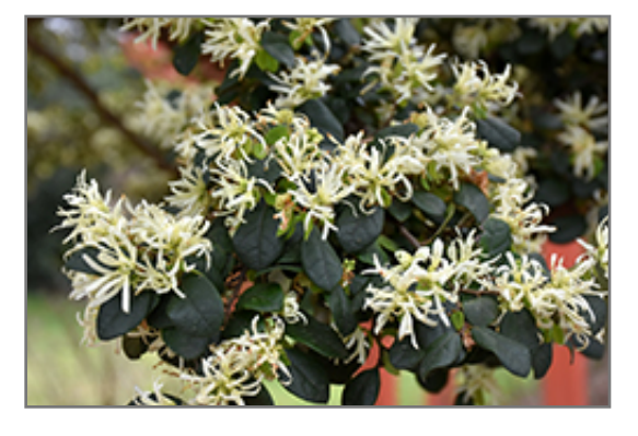
Chinese Fringeflower flowers