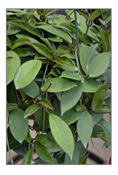
Wax Plant foliage

When grown indoors, Wax Plant can be expected to grow to be about 10 inches tall at maturity, with a spread of 4 feet. It grows at a medium rate, and under ideal conditions can be expected to live for approximately 10 years. This houseplant performs well in both bright or indirect sunlight and strong artificial light, and can therefore be situated in almost any well-lit room or location. It is very adaptable to both dry and moist soil, but will not tolerate any standing water. The surface of the soil shouldn't be allowed to dry out completely, and so you should expect to water this plant once and possibly even twice each week. Be aware that your particular watering schedule may vary depending on its location in the room, the pot size, plant size and other conditions; if in doubt, ask one of our experts in the store for advice. It is particular about its soil conditions, with a strong preference for rich, acidic soil. Contact the store for specific recommendations on pre-mixed potting soil for this plant.