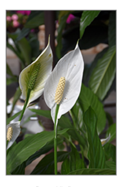
Peace Lily flowers

When grown indoors, Peace Lily can be expected to grow to be about 30 inches tall at maturity, with a spread of 30 inches. It grows at a medium rate, and under ideal conditions can be expected to live for approximately 10 years. This houseplant performs well in both bright or indirect sunlight and strong artificial light, and can therefore be situated in almost any well-lit room or location. It prefers to grow in average to moist soil. The surface of the soil shouldn't be allowed to dry out completely, and so you should expect to water this plant once and possibly even twice each week. Be aware that your particular watering schedule may vary depending on its location in the room, the pot size, plant size and other conditions; if in doubt, ask one of our experts in the store for advice. It is particular about its soil conditions, with a strong preference for rich, acidic soil. Contact the store for specific recommendations on pre-mixed potting soil for this plant. Be warned that parts of this plant are known to be toxic to humans and animals, so special care should be exercised if growing it around children and pets.