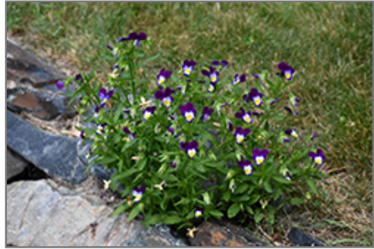
Johnny Jump-Up in bloom

Johnny Jump-Up will grow to be only 4 inches tall at maturity extending to 6 inches tall with the flowers, with a spread of 6 inches. When grown in masses or used as a bedding plant, individual plants should be spaced approximately 5 inches apart. It grows at a fast rate, and tends to be biennial, meaning that it puts on vegetative growth the first year, flowers the second, and then dies. However, this species tends to self-seed and will thereby endure for years in the garden if allowed. As an herbaceous perennial, this plant will usually die back to the crown each winter, and will regrow from the base each spring. Be careful not to disturb the crown in late winter when it may not be readily seen!