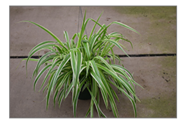
Reverse Variegated Spider Plant in full

This plant will require occasional maintenance and upkeep, and should not require much pruning, except when necessary, such as to remove dieback. Gardeners should be aware of the following characteristic(s) that may warrant special consideration;