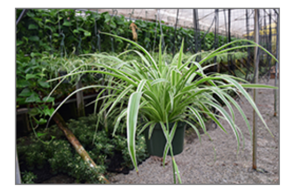
Reverse Variegated Spider Plant in full

Reverse Variegated Spider Plant is an herbaceous perennial with an upright spreading habit of growth. Its medium texture blends into the garden, but can always be balanced by a couple of finer or coarser plants for an effective composition.