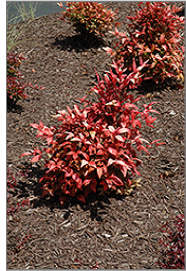
Fire Power Nandina

Fire Power Nandina makes a fine choice for the outdoor landscape, but it is also well-suited for use in outdoor pots and containers. It can be used either as 'filler' or as a 'thriller' in the 'spiller-thriller-filler' container combination, depending on the height and form of the other plants used in the container planting. It is even sizeable enough that it can be grown alone in a suitable container. Note that when grown in a container, it may not perform exactly as indicated on the tag - this is to be expected. Also note that when growing plants in outdoor containers and baskets, they may require more frequent waterings than they would in the yard or garden.