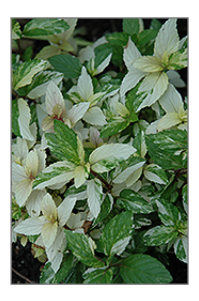
Variegated Peppermint foliage