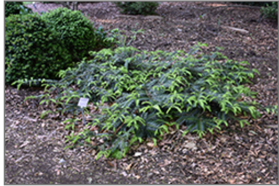
Chinese Plum Yew

Chinese Plum Yew is recommended for the following landscape applications;