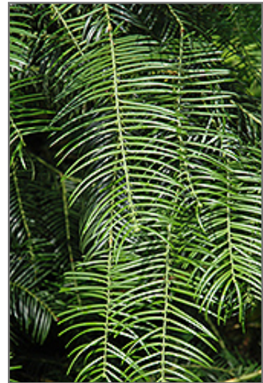
Chinese Plum Yew foliage