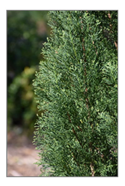
Blue Italian Cypress foliage