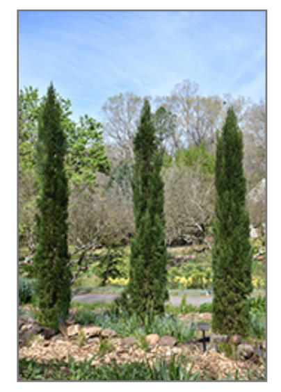
Blue Italian Cypress