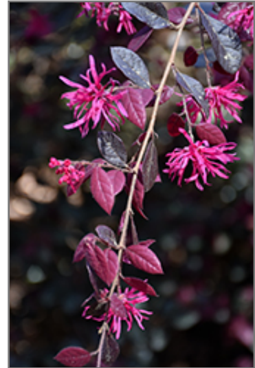
Purple Diamond Fringeflower flowers

Purple Diamond Fringeflower is recommended for the following landscape applications;