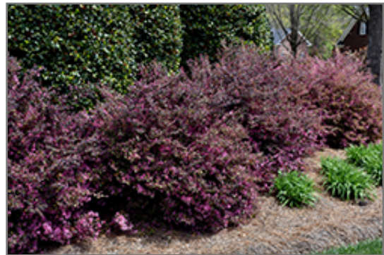
Purple Diamond Fringeflower in bloom