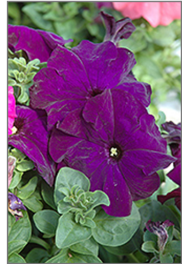
Dreams Midnight Petunia flowers