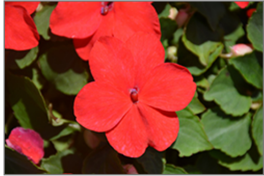
Super Elfin XP Melon Impatiens in bloom

Super Elfin XP Melon Impatiens is recommended for the following landscape applications;