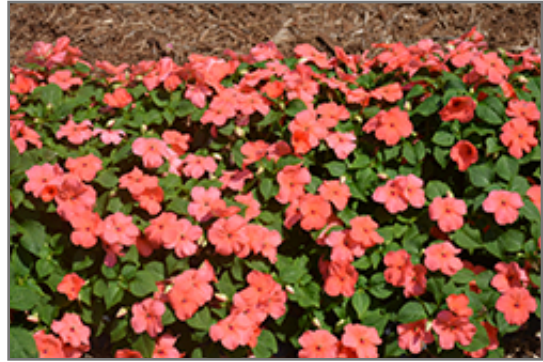
Super Elfin XP Melon Impatiens flowers

Super Elfin XP Melon Impatiens will grow to be about 10 inches tall at maturity, with a spread of 12 inches. When grown in masses or used as a bedding plant, individual plants should be spaced approximately 10 inches apart. Its foliage tends to remain low and dense right to the ground. This fast-growing annual will normally live for one full growing season, needing replacement the following year.