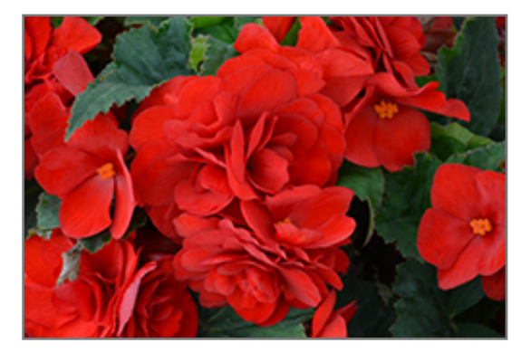
Nonstop Deep Red Begonia flowers

Nonstop Deep Red Begonia is an herbaceous perennial with a mounded form. Its medium texture blends into the garden, but can always be balanced by a couple of finer or coarser plants for an effective composition.