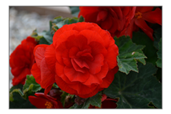
Nonstop Deep Red Begonia flowers