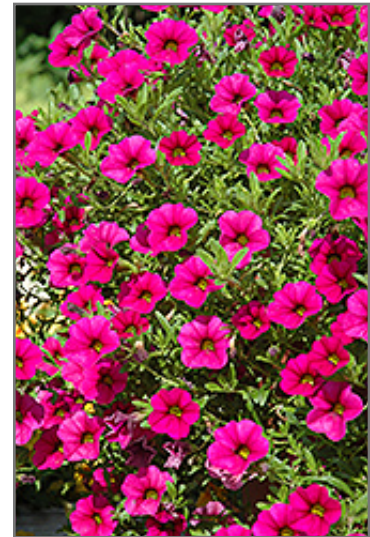
Cabaret Rose Calibrachoa flowers