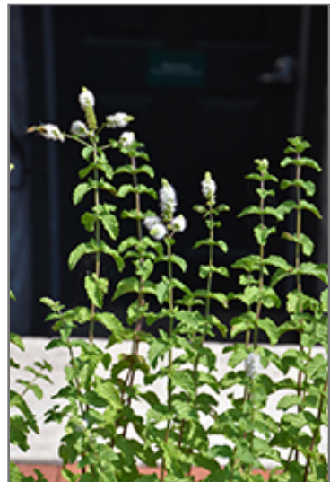
Spearmint flowers