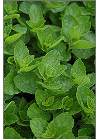
Spearmint foliage

Spearmint features bold spikes of lilac purple tubular flowers with white overtones rising above the foliage in late summer. Its attractive fragrant oval leaves remain green in color throughout the season.