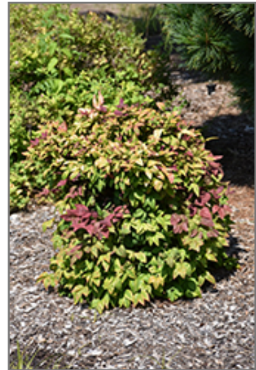
Blush Pink Nandina

Blush Pink Nandina makes a fine choice for the outdoor landscape, but it is also well-suited for use in outdoor pots and containers. It can be used either as 'filler' or as a 'thriller' in the 'spiller-thriller-filler' container combination, depending on the height and form of the other plants used in the container planting. It is even sizeable enough that it can be grown alone in a suitable container. Note that when grown in a container, it may not perform exactly as indicated on the tag - this is to be expected. Also note that when growing plants in outdoor containers and baskets, they may require more frequent waterings than they would in the yard or garden.