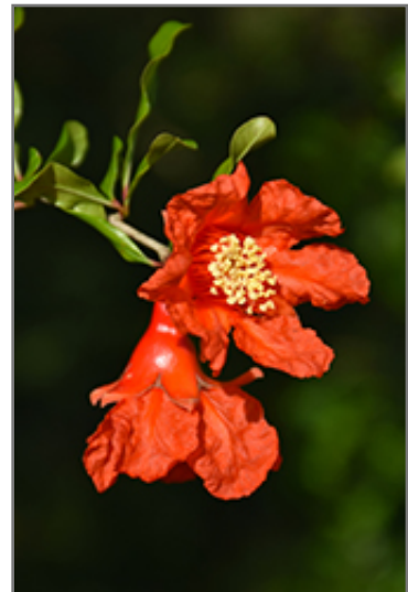
Pomegranate flowers