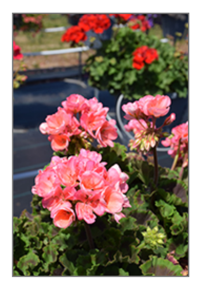
Americana Salmon Geranium flowers

Bossier City – Shreveport – Longview – Texarkana – Beaumont