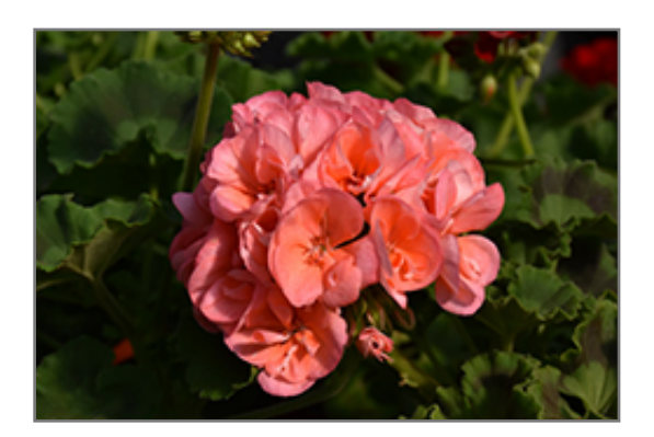
Americana Salmon Geranium flowers