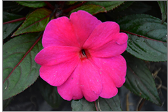
Magnum Blue New Guinea Impatiens flowers

Magnum Blue New Guinea Impatiens is recommended for the following landscape applications;