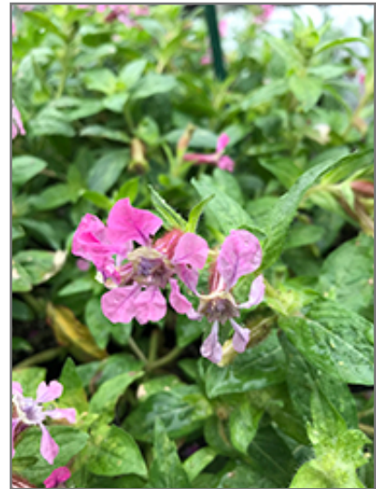
Sriracha Pink Cuphea flowers