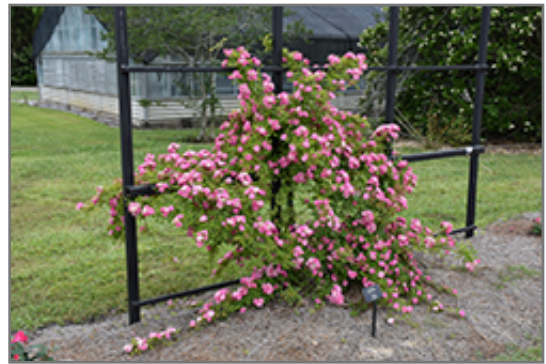
Peggy Martin Rose in bloom