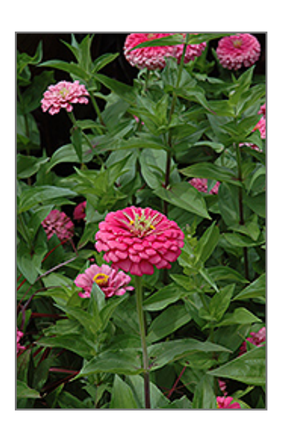
Miss Willmott Zinnia flowers

Miss Willmott Zinnia will grow to be about 32 inches tall at maturity, with a spread of 24 inches. When grown in masses or used as a bedding plant, individual plants should be spaced approximately 18 inches apart. Its foliage tends to remain dense right to the ground, not requiring facer plants in front. This fast-growing annual will normally live for one full growing season, needing replacement the following year.