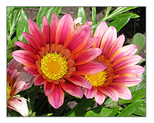
Daybreak Pink Shades Gazania flowers

Plant Height: 8 inches Flower Height: 12 inches Spread: 12 inches Spacing: 10 inches Sunlight: O Hardiness Zone: (annual) Other Names: Treasure Flower Group/Class: Daybreak Series