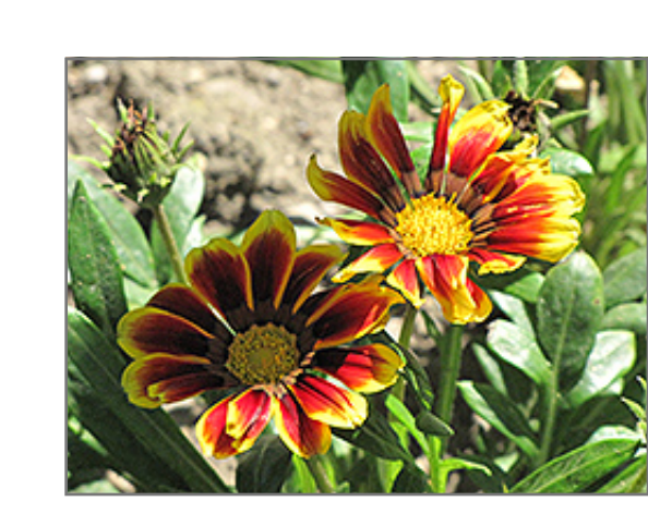
Kiss Golden Flame Gazania flowers