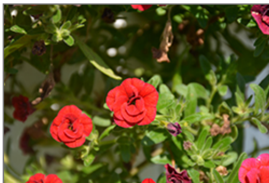
MiniFamous Double Compact Red Calibrachoa flowers