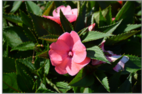
SunPatiens Spreading Shell Pink New Guinea Impatiens flowers

SunPatiens Spreading Shell Pink New Guinea Impatiens is recommended for the following landscape applications;