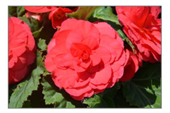
Nonstop Deep Rose Begonia flowers