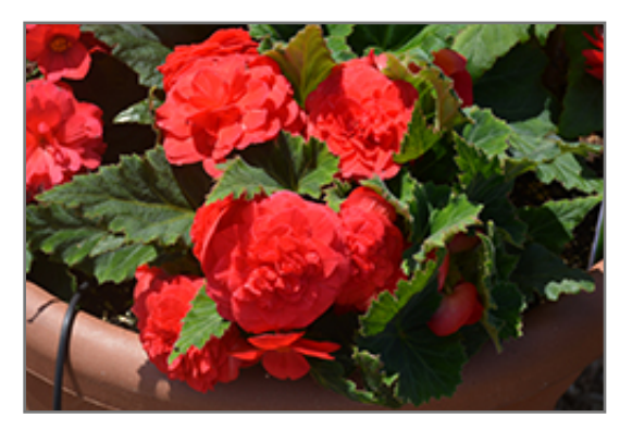
Nonstop Deep Rose Begonia flowers

Nonstop Deep Rose Begonia is an herbaceous perennial with a mounded form. Its medium texture blends into the garden, but can always be balanced by a couple of finer or coarser plants for an effective composition.