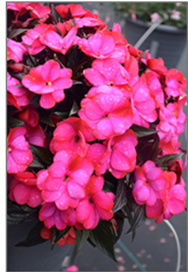
Infinity Blushing Lilac New Guinea Impatiens flowers

Infinity Blushing Lilac New Guinea Impatiens is recommended for the following landscape applications;