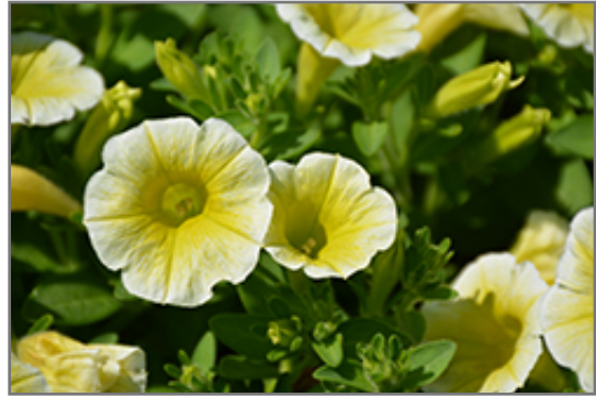
Blanket Yellow Petunia flowers

Blanket Yellow Petunia is recommended for the following landscape applications;