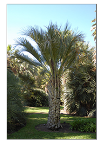
Upright Jelly Palm