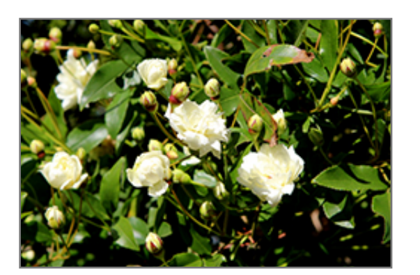
White Lady Banks Rose flowers

Bossier City - Shreveport - Longview - Texarkana - Beaumont