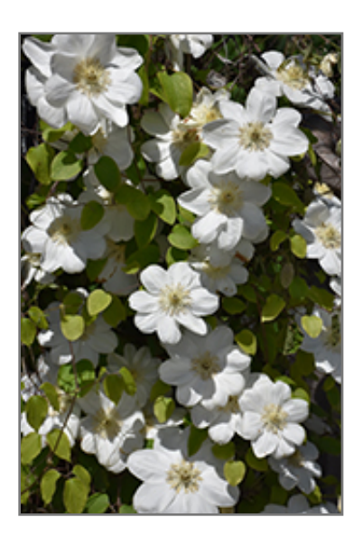
Guernsey Cream Clematis flowers