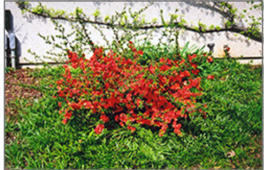
Common Flowering Quince in bloom

This is a high maintenance shrub that will require regular care and upkeep, and should only be pruned after flowering to avoid removing any of the current season's flowers. Gardeners should be aware of the following characteristic(s) that may warrant special consideration;